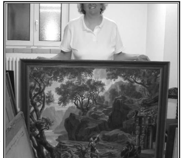
III.2 Götterdäm- merung ; Act 2; Scene in front of the Gibichung Hall.